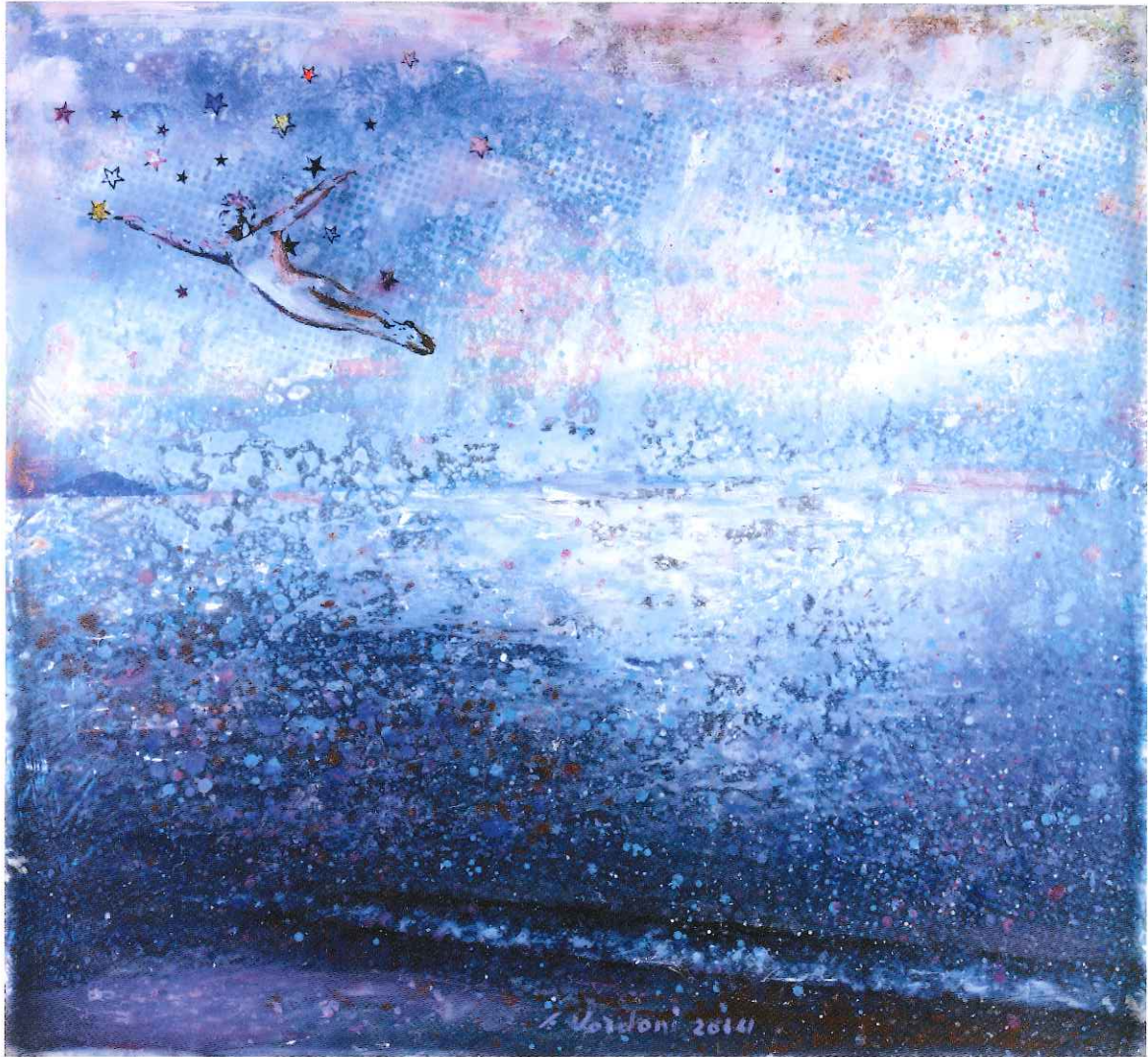
Freedom, 2014, oil on transparencies and metal, 62x67 cm