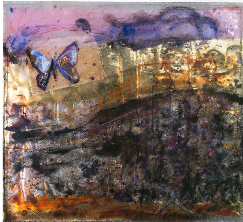
Butterfly, 2011, oil on transparencies and metal, 37x42 cm