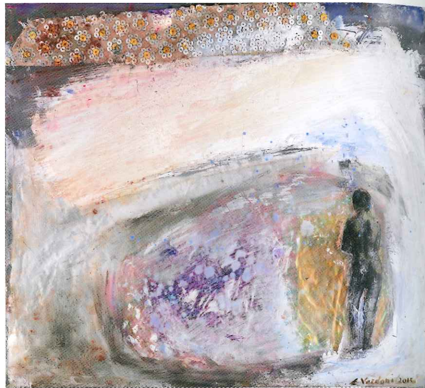
There, 2015, oil on transparencies and metal, 37x42 cm