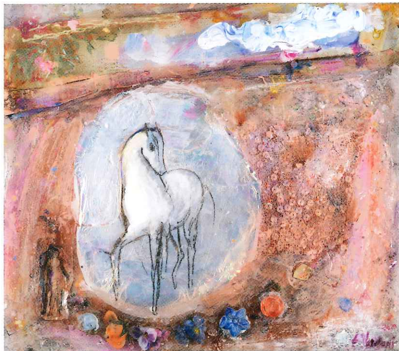
Horse of Fortune, 2011, oil on transparencies and metal, 37 x 42 cm