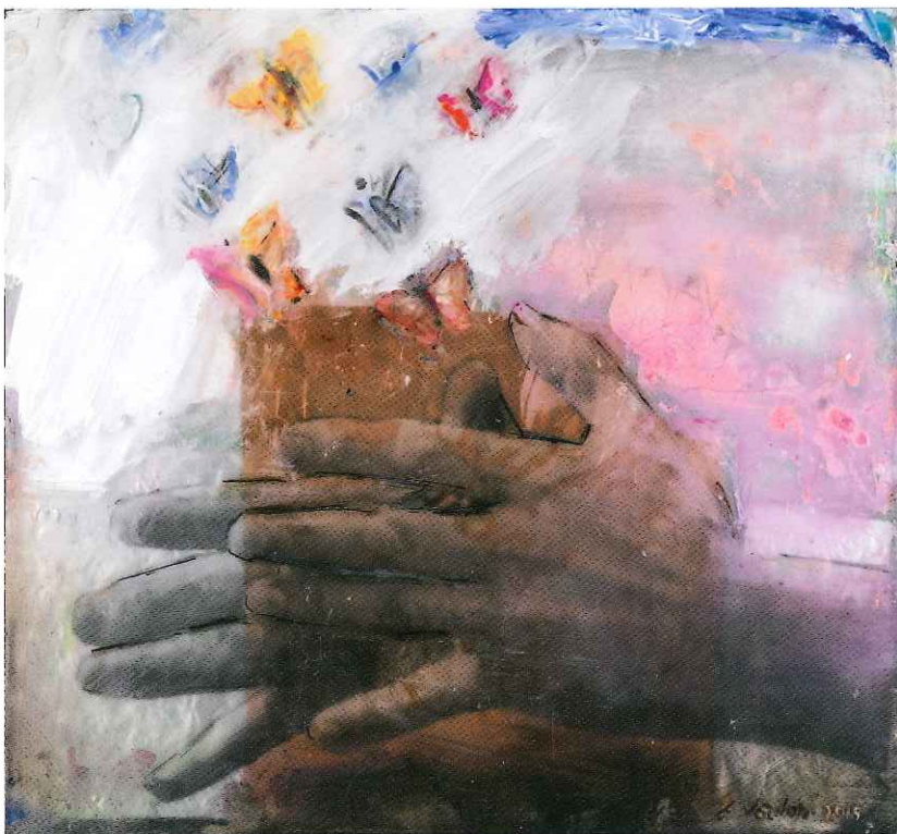
Applause, 2015, oil on transparencies and metal, 37x42 cm