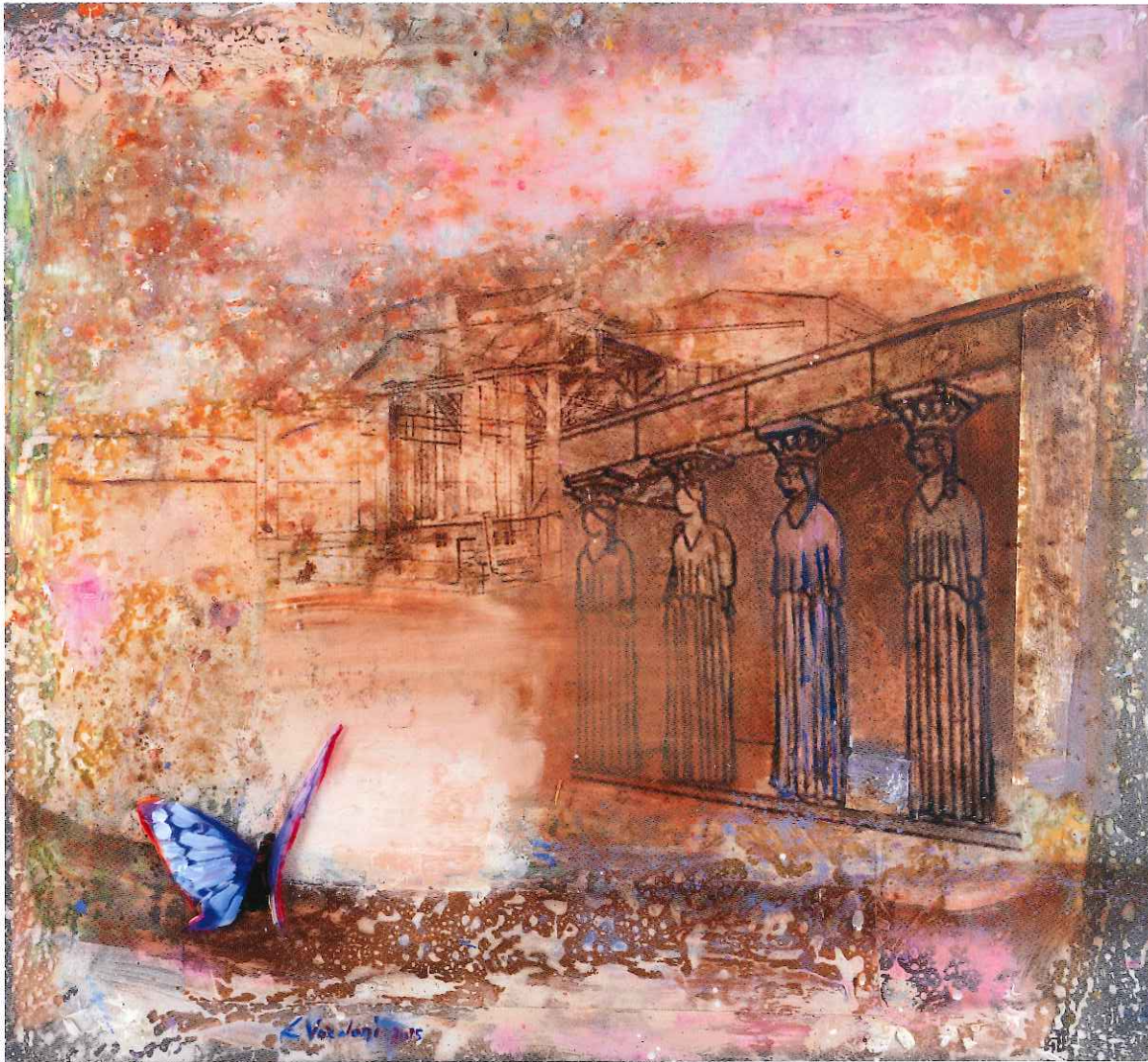
Birth place, 2015, oil on transparencies and metal, 62 x 67 cm