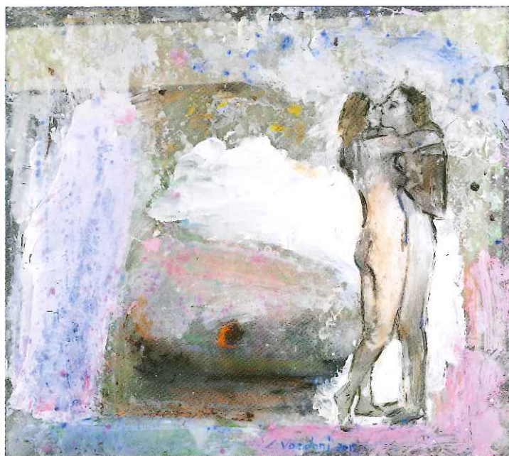
Kismet, 2015, oil on transparencies and metal, 37x42 cm