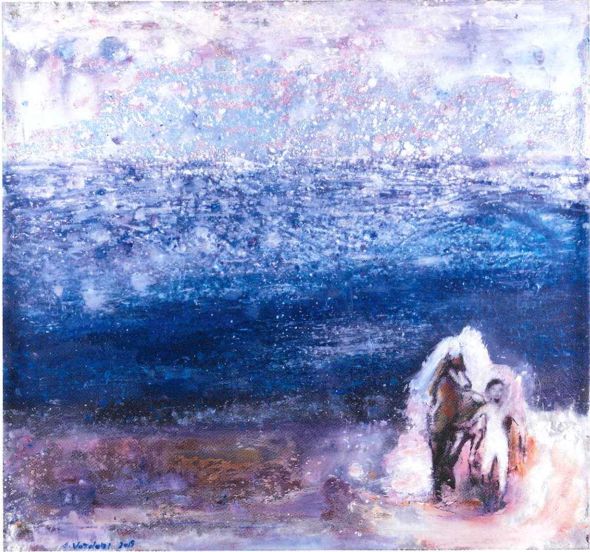
Suddenly, 2014, oil on transparencies and metal, 62x67 cm