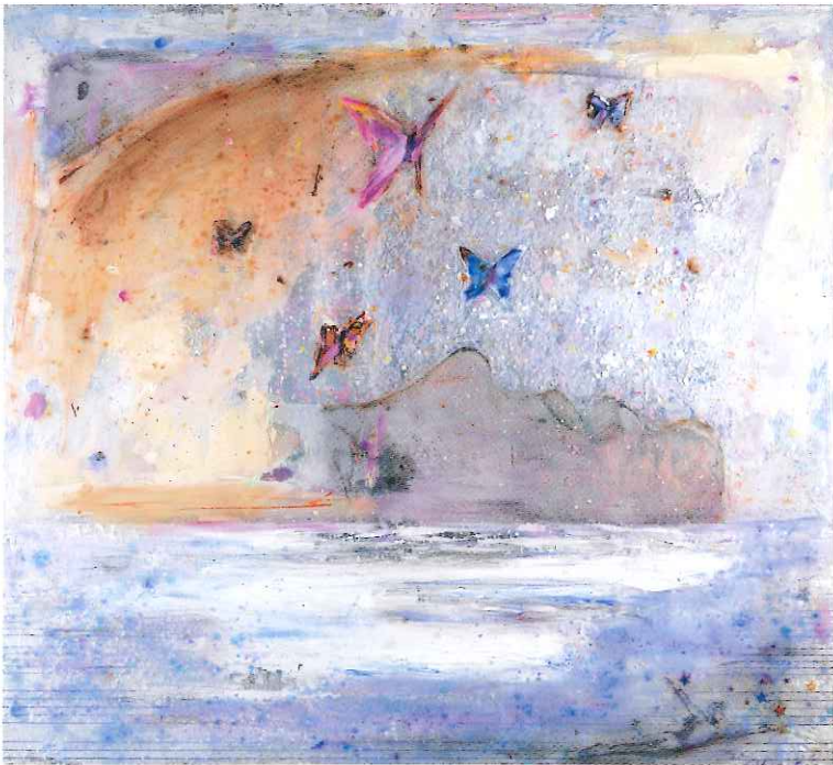
Sweet Dreams, 2012, oil on transparencies and metal, 102x 122 cm