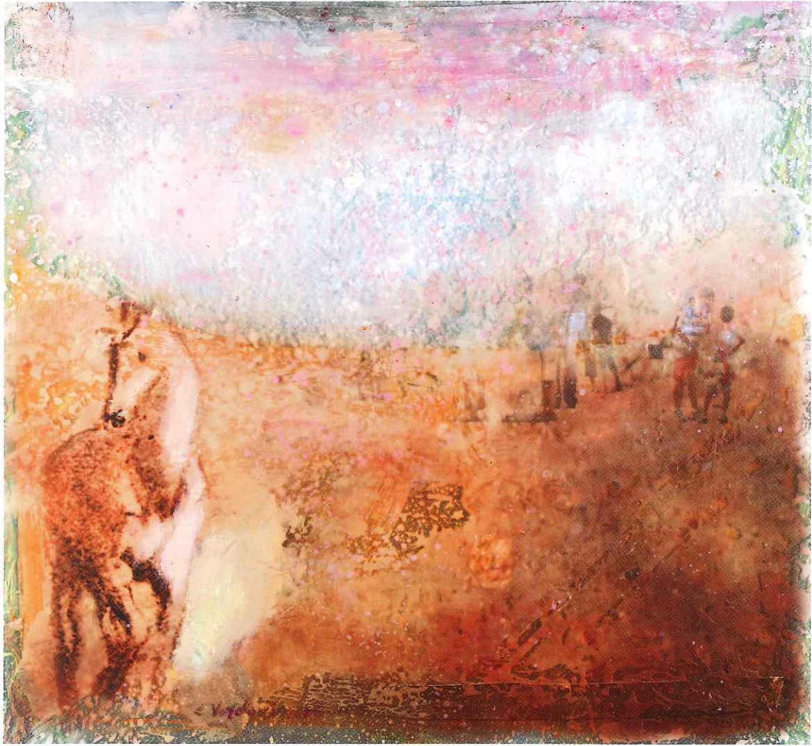
Good luck, 2015, oil on transparencies and metal, 62 x 67 cm