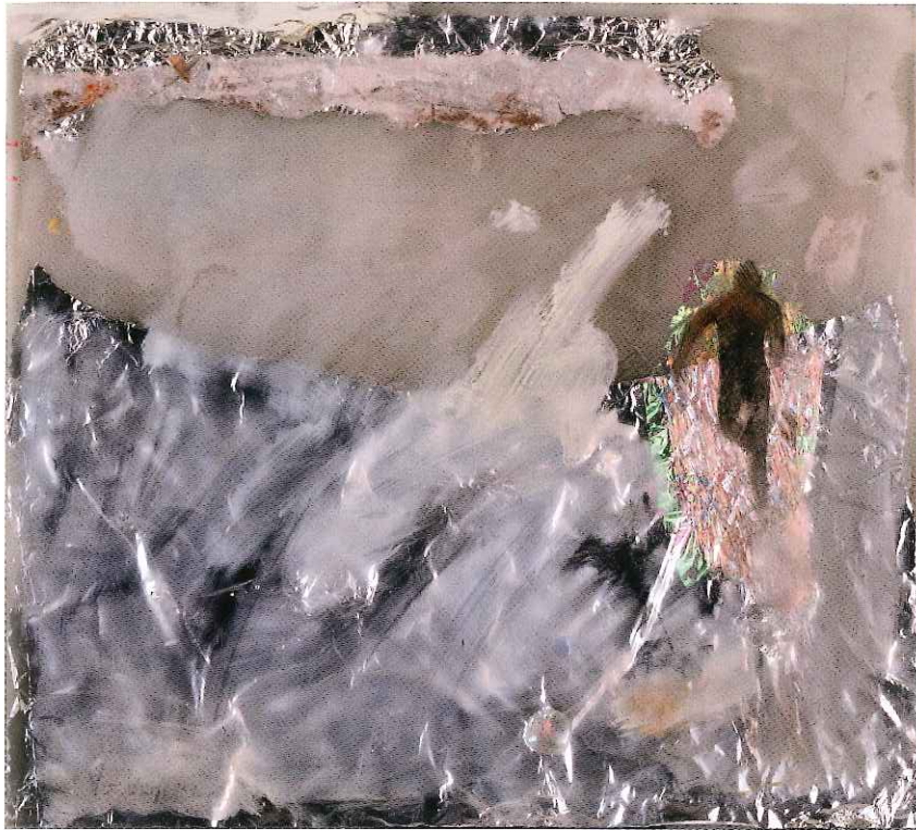
Sky Hunter, 2008, oil on transparencies and metal, 37x42 cm