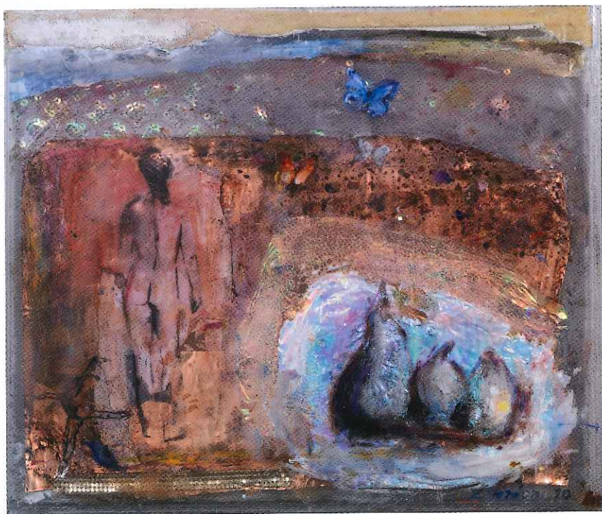
Small talk, 2010, oil on transparencies and metal, 37x42 cm